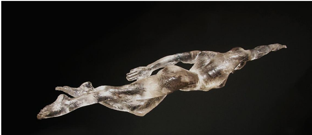
"Into Light" by Karen Wight